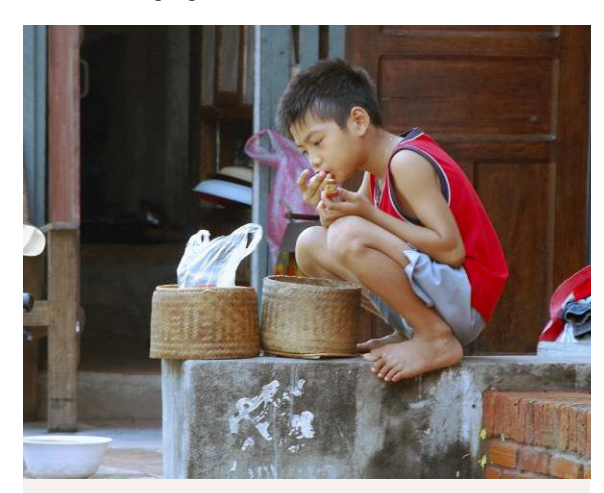
Rice is more than food, it is life

Access to food is unreliable and inconsistent especially to vulnerable groups and in various regions. Poverty rates have fallen over time at the national level but are observed to be higher in rural households and among ethnic minorities. Women and children are at risk since the pressure to increase earnings will have impacts on breastfeeding, child care, child labor, school attendance and out of pocket health expenditures. While Viet Nam's overall poverty rate suggests proper access to food and other necessities, poverty is highly variable among regions.